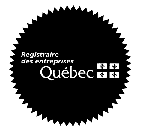
Registraire des entreprises