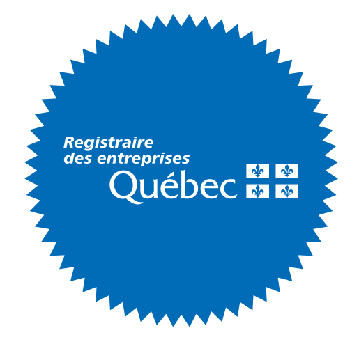
Registraire des entreprises